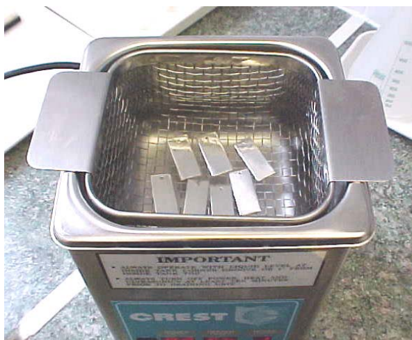
Figure 1 Ultrasonic Solvent Cleaning Bath