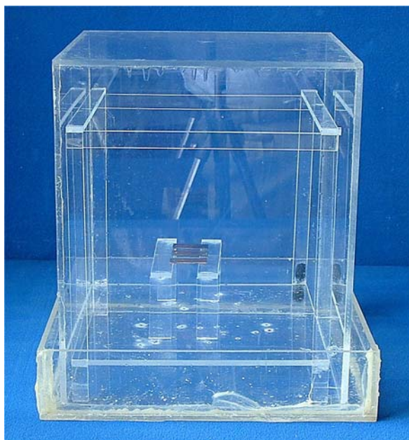
Figure 2 Thioacetamide Test Chamber